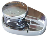
V6 Deck unit Gypsy Only