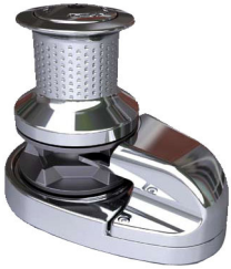
V6 Deck unit Gypsy Drum