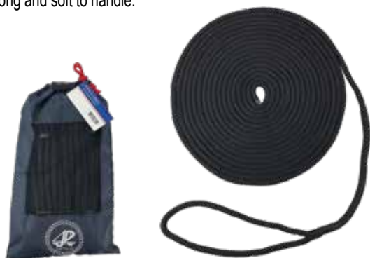
Supplied in a mesh bag for easy storage