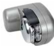
Suitable for rope chain gypsy on anchor winches