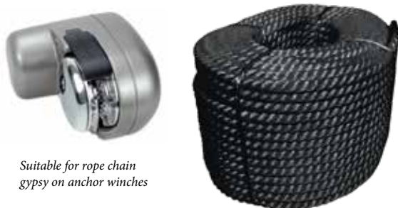
Suitable for rope chain gypsy on anchor winches